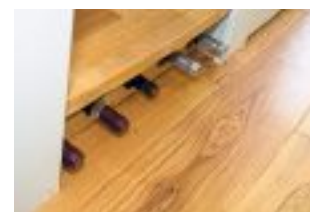
Good use of space for a wine store.