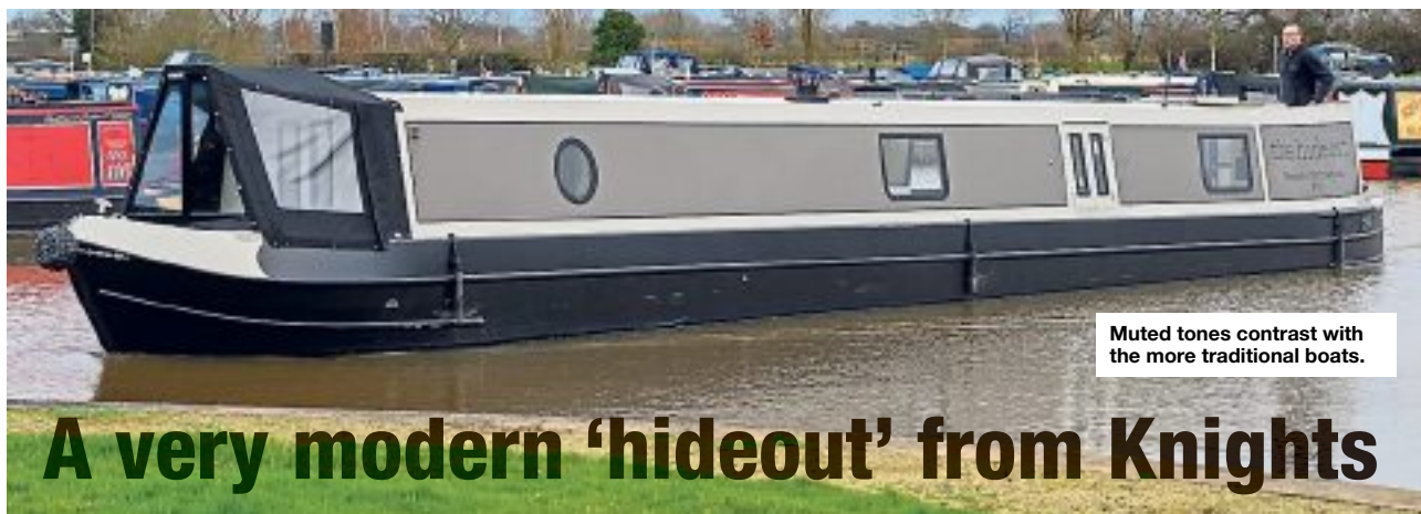
Muted tones contrast with the more traditional boats.