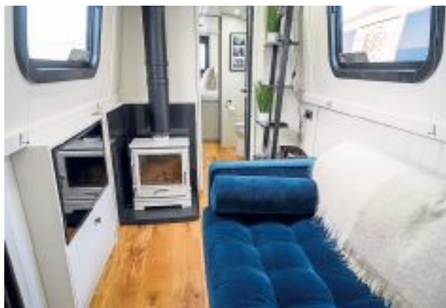
The comfortable and contemporary saloon.

The adjacent washroom has a walkthrough layout with a stylish shower enclosure (can't really call it a cubicle) tiled in black and grey small hexagon mosaics and with a square, black shower head. A sliding door provides access to this space which sits opposite the Vetus pump-out toilet and the rectangular washbasin mentioned earlier.