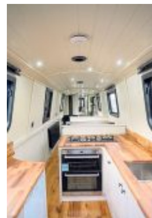
The light and minimalist interior.

Price: From £125,000 for a boat of similar specification.