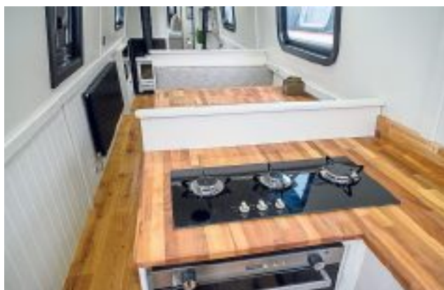
Glad to see the grain all running the same way!