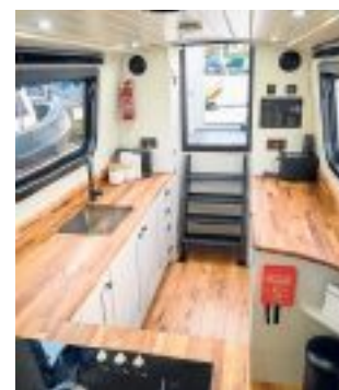
The well laid out galley.