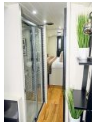
Shower set to one side of the washroom.